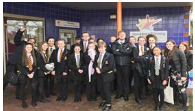
Student MFL Ambassadors from Stourport High School

The week of events was a great collaboration between the two schools which resulted in a fabulous week of learning, with students inspired to develop their love of languages. Children were split into mixed year groups and activities ranged from learning French and German to exploring different countries. This has proved a very popular event and one that is looked forward to each year.