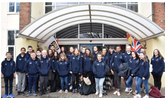
Students outside Stourport High School in hoodies kindly purchased by host families.

Thank you to everyone involved in making the French Exchange a massive success, especially parents and staff who hosted our visitors and to the many staff and community members who have supported either financially or with their time. Plans for next year's French Exchange are already underway and current Year 8 students are to speak to their French teacher for more details if they would like to be involved.