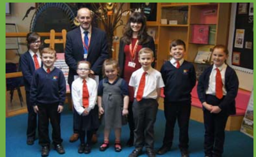
With students from Stourport Primary Academy