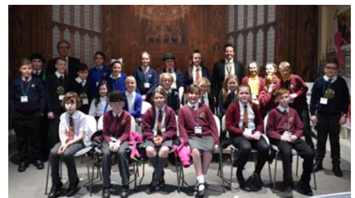
Students from all Trust primaries at Westminster

Students across the Trust met our local MPs Mark Garnier and Nigel Huddleston when they visited the Houses of Parliament earlier this month.